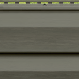
Double 5" Dutchlap