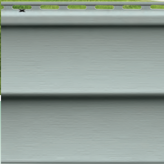
Double 4" Clapboard