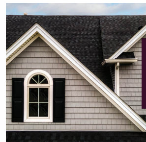
Matching and contrasting soffit, accessories, shakes and shingles available to give your home a one-of-a-kind look.