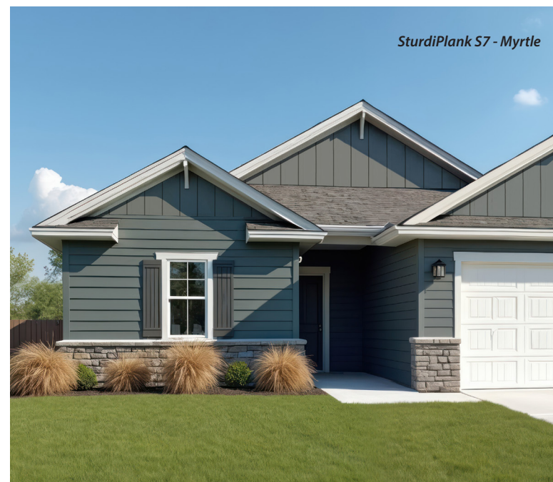
SturdiPlank S7 - Myrtle