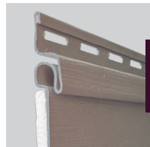
.046" panel thickness, with a cedar grain pattern A 3/4" panel projection provides rigidity and casts deep, appealing shadow lines.