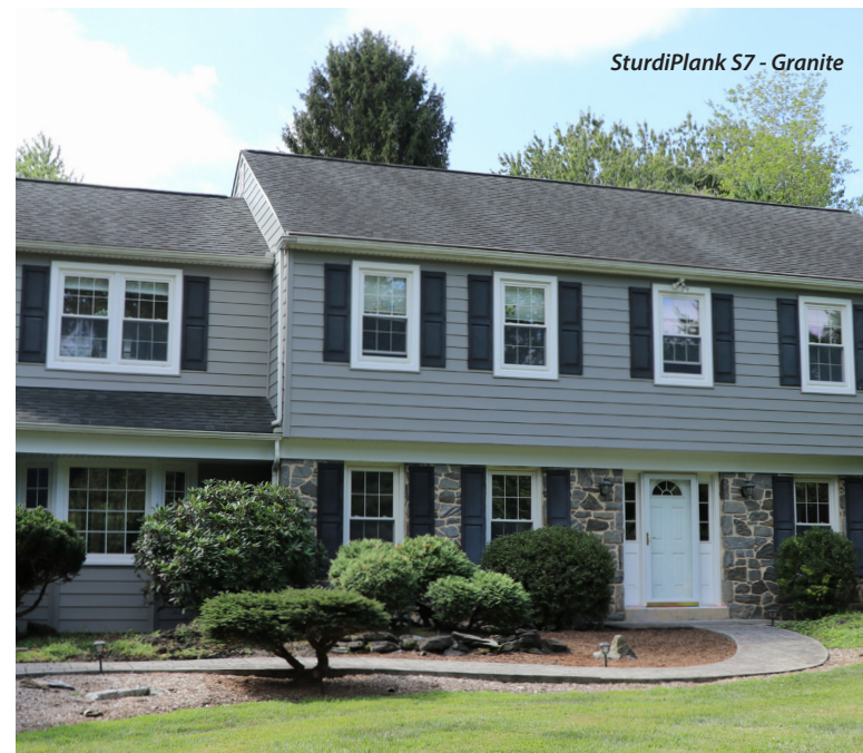
SturdiPlank S7 - Granite

A sound investment that can help increase the resale value of your home.