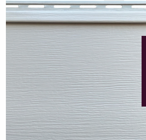
Single 7" Reinforced Clapboard