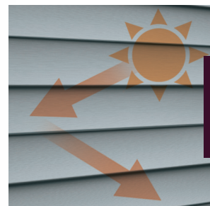
COLORHOLD® Lifetime Fade Protection ColorHold® is a highly durable capstock that resists fading and discoloring and is backed by a limited lifetime transferable warranty*, including Lifetime Fade Protection. Specify the most brilliant and rich hues with absolute confidence. *Visit www.norandex.com to view warranty details.