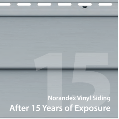
Norandex Vinyl Siding After 15 Years of Exposure