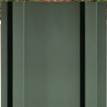
S12 Board & Batten