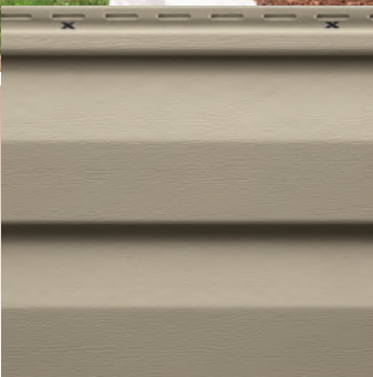
Double 5" Dutchlap