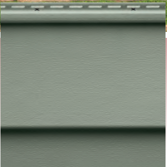
Double 6" Clapboard