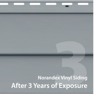
Norandex Vinyl Siding After 3 Years of Exposure