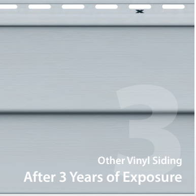
Other Vinyl Siding After 3 Years of Exposure

This is a visual representation of the actual fade that can be expected on vinyl siding and soffit. Colors are mechanically reproduced.