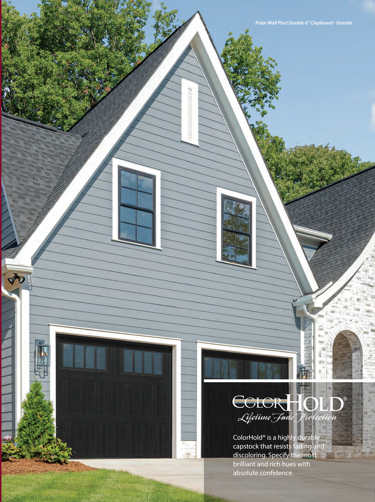
Polar Wall Plus! Double 6" Clapboard - Granite