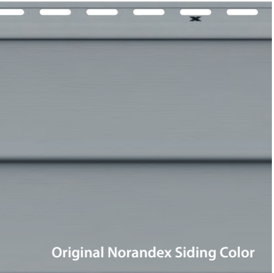
Original Norandex Siding Color