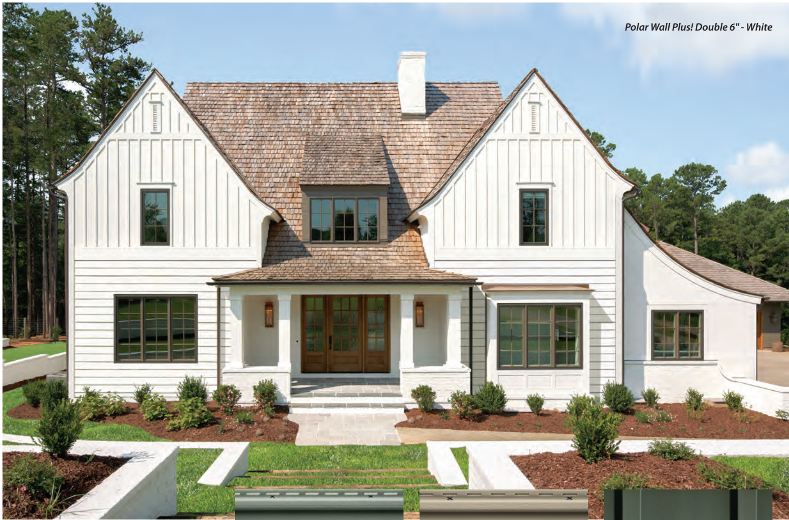
Polar Wall Plus! Double 6" - White

A sound investment that can help increase the resale value of your home.