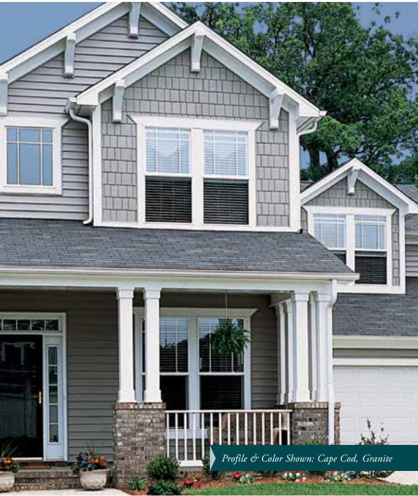
Profile & Color Shown: Cape Cod, Granite