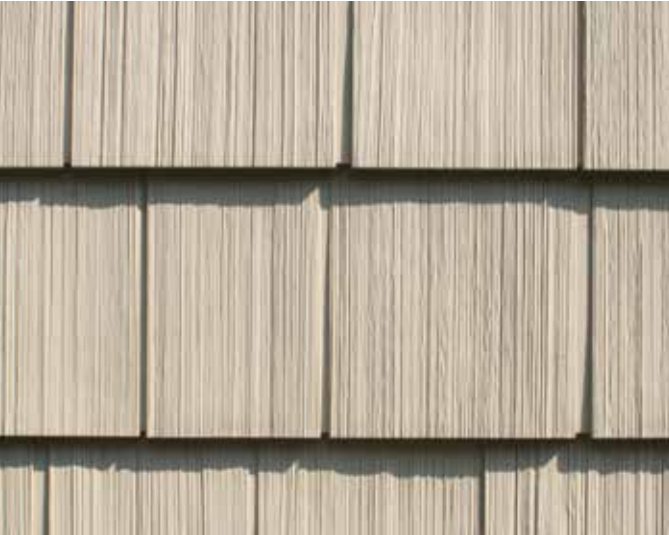
7" Traditional Shake