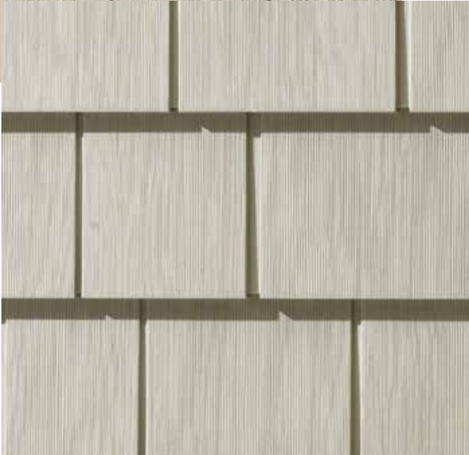
5" Double-course Cape Cod Shingle