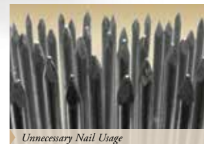
Unnecessary Nail Usage

NailRIGHT helps guide the installer to the studs for an installation that's strong, secure and resistant to blow offs.